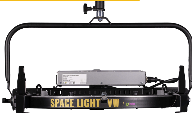
SPACE LIGHT - NAKED