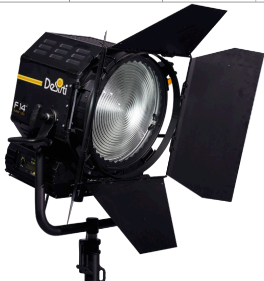
F14 HP VW